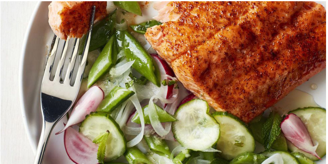
Photo cred: http://www.eatingwell.com/recipe/255217/mediterranean-chicken-quinoa-bowl/

https://www.womansday.com/food-recipes/food-drinks/recipes/a58512/roasted-blackened-salmon-snap-pea-salad-recipe/